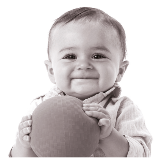
check out family links.org.uk

"It was a completely new experience for me but after the first week I was completely relaxed"